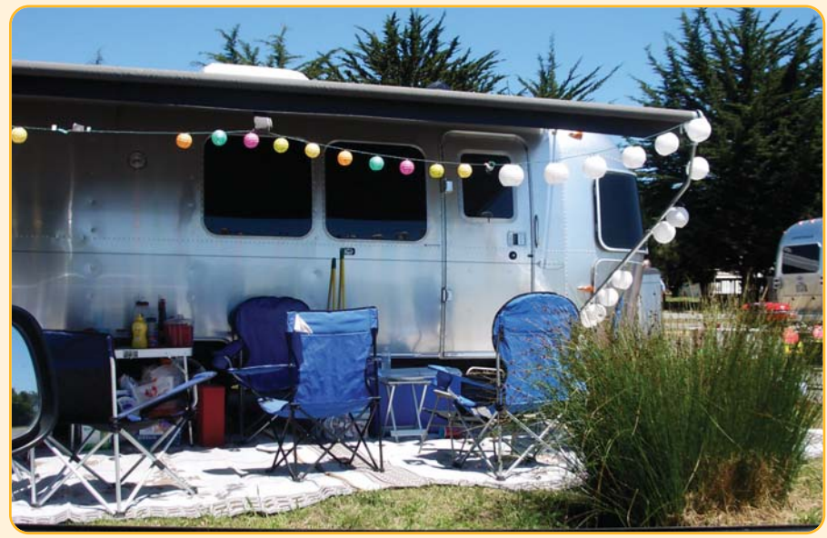
ABOVE: Big Sur, California, roadside SR 1. Sunset at Santa Cruz Harbor, Twin Lakes Beach. Follow these Airstreamers and reserve a view site at the end of South Whales, Costanoa Resort, Pescadero, California.